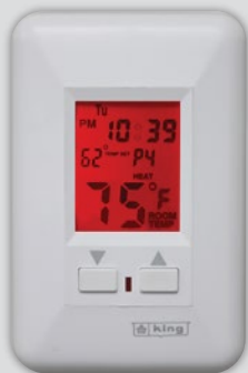
ESP120 ESP230 Programmable