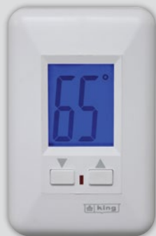
ES230 Non Programmable