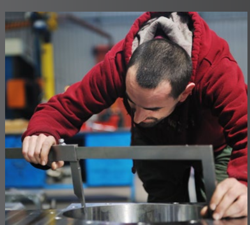
Advanced Features for Ease of Use & Energy Savings